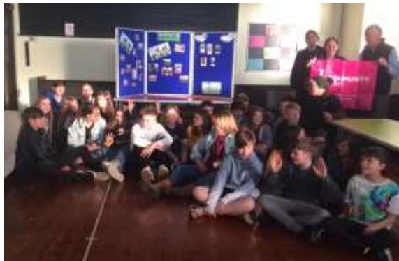
Hamdon Youth Group meeting in the new Families and Youth Centre in Stoke